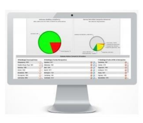
Main IPR Management System

Micad is cloud based multi-disciplinary estate and property management system that enables professionals to make decisions, maximise ROI and support operations based on 100% accurate estates information.