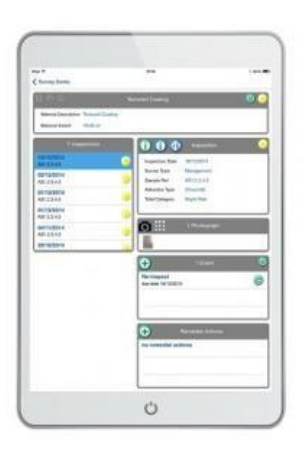
Mobile Apple App