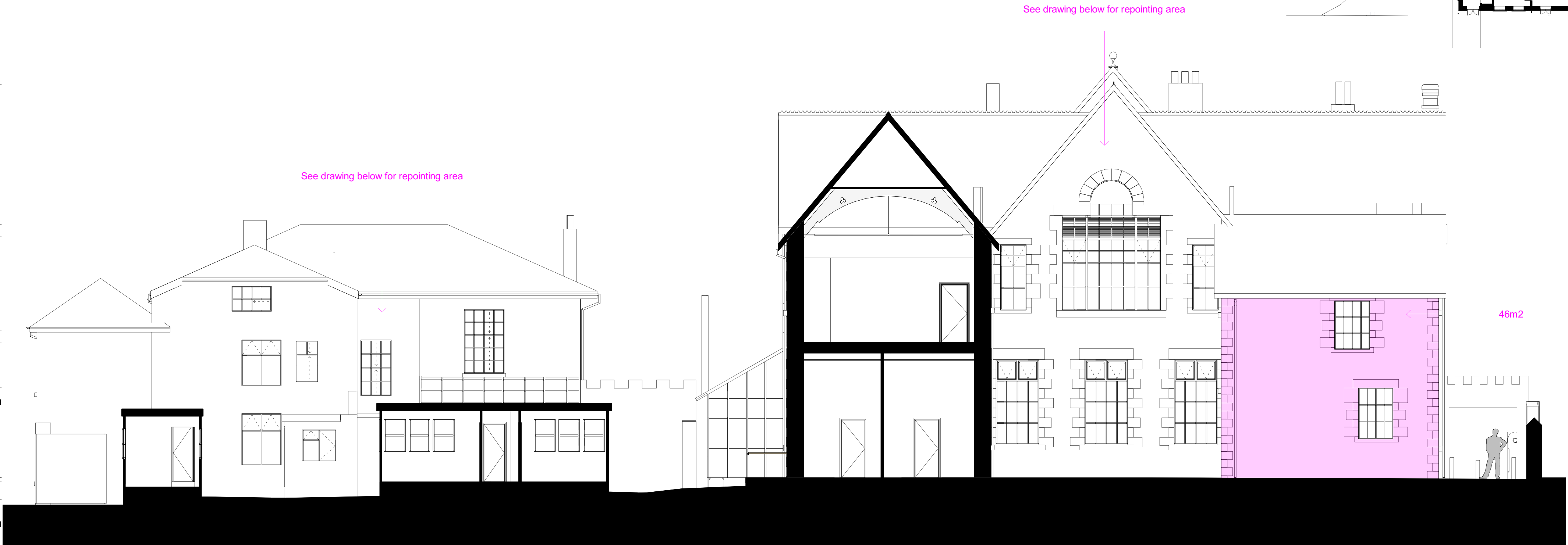
SECTIONAL ELEVATION - GA - EXISTING - EE - WEST- GRANITE FACADE REPAIR & REPOINTING 1: 100

▲ LEVEL 00 - EX. BASSET (EAST) 106495 ▲ LEVEL 00 - EX. WHITE HOUSE 106345 ▲ LEVEL 00 - EX. BASSET (WEST) 105980 ▲ LEVEL 00 - EX. WHITE HOUSE NORTH 105710