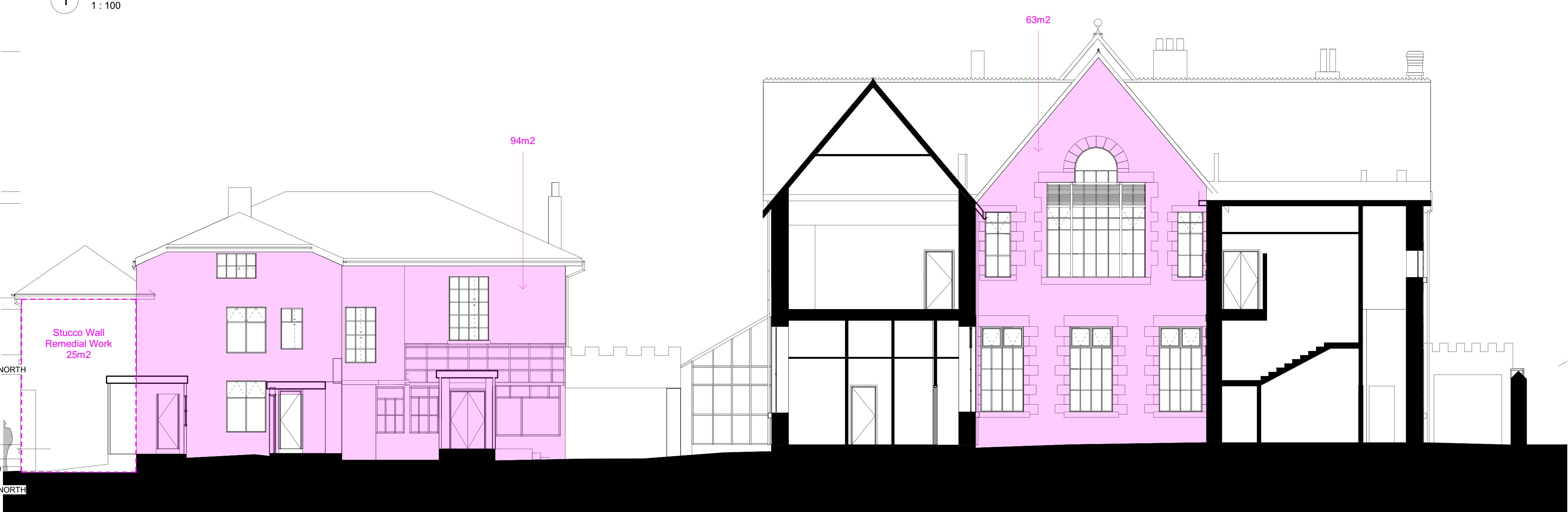
SECTIONAL ELEVATION - GA - EXISTING - FF - WEST- GRANITE FACADE REPAIR & REPOINTING 1: 100

▲ LEVEL 00 - EX. BASSET (EAST) 106495 ▲ LEVEL 00 - EX. WHITE HOUSE 106345 ▲ LEVEL 00 - EX. BASSET (WEST) 105980 ▲ LEVEL 00 - EX. WHITE HOUSE NORTH 105710