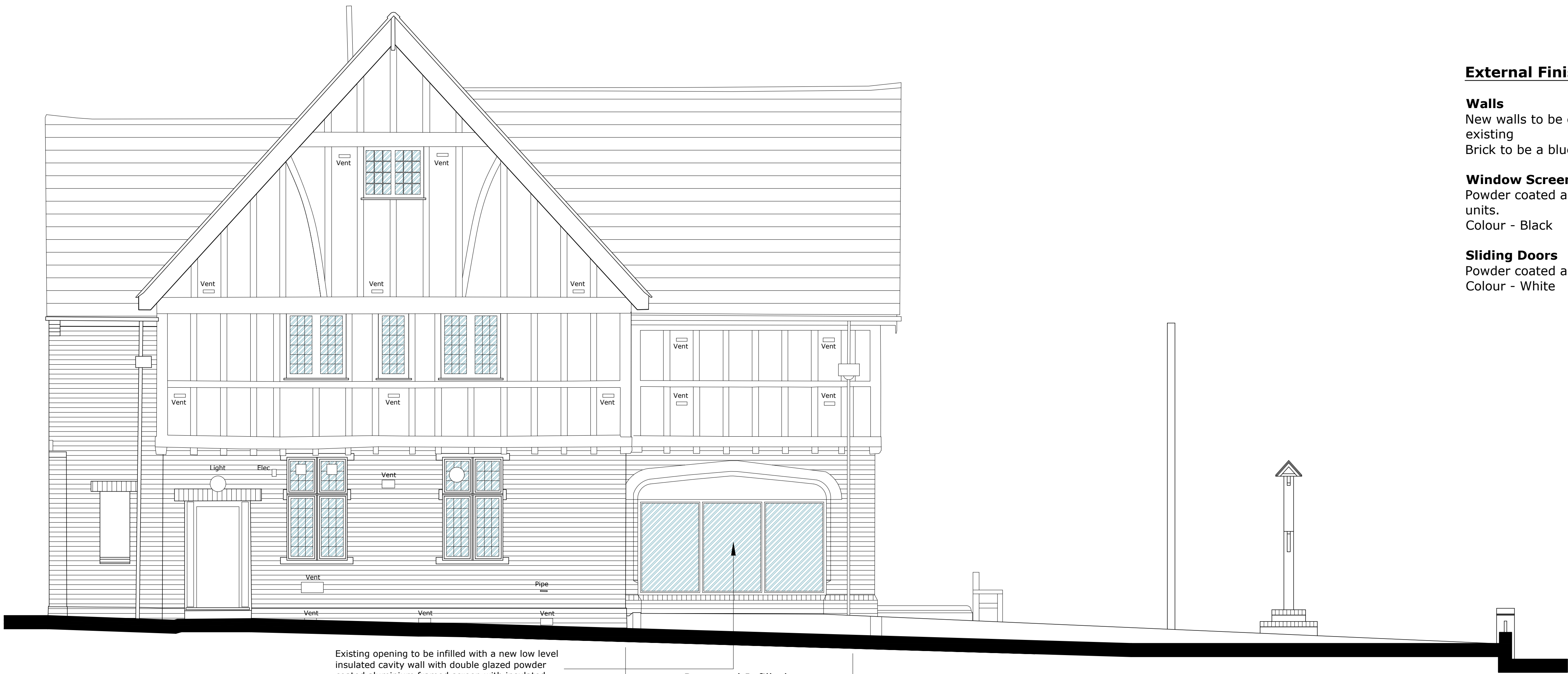
Part North East Elevation as Proposed (Front)

Existing opening to be infilled with a new low level insulated cavity wall with double glazed powder coated aluminium framed screen with insulated head infill panel installed above to form new enclosed Entrance Foyer as indicated.