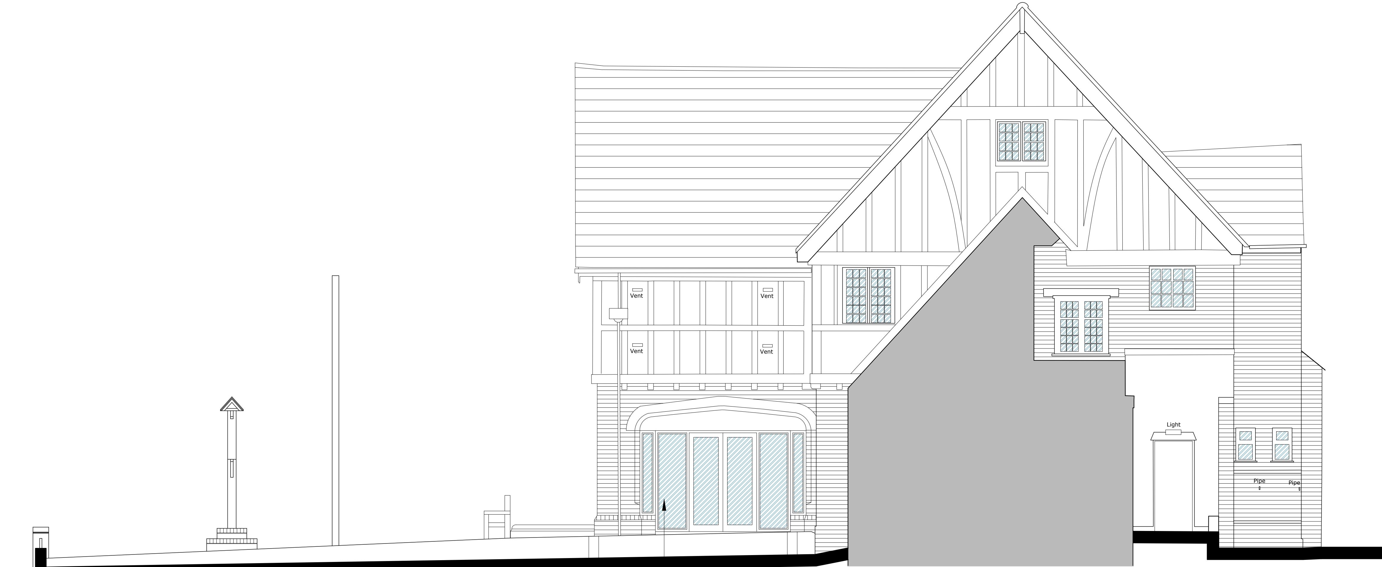
South East Elevation as Proposed (Side)

Existing opening to be infilled with a new low level insulated cavity wall with double glazed powder coated aluminium framed screen incorporating double glazed automatic Bi-sliding doors with an insulated head infill panel installed above to form new enclosed Entrance Foyer as indicated.