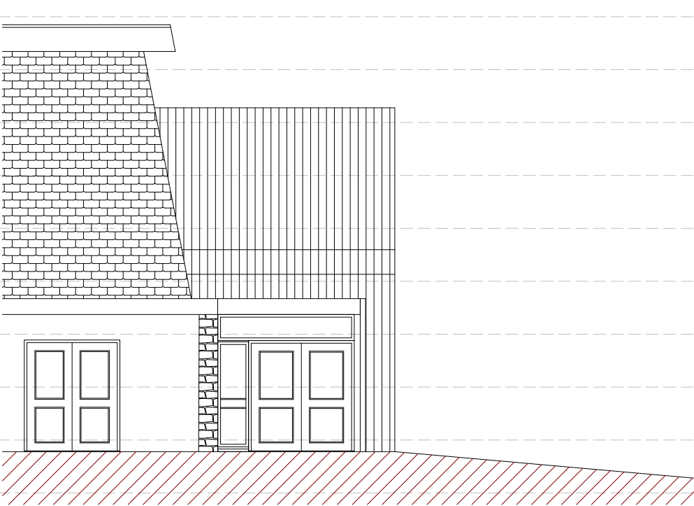
Existing Side Elevation (North)