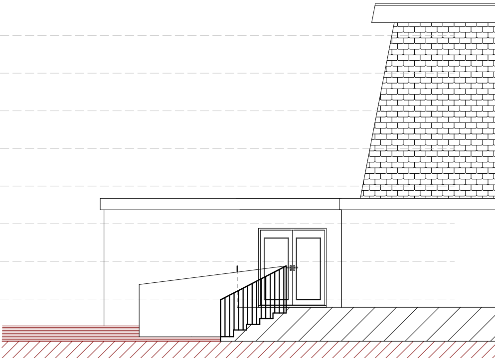
Proposed Side Elevation (South)

FINISHES Walls to be rendered Roof to be GRP installed by specialist Windows to be white UPVC Fascia and guttering to be White UPVC