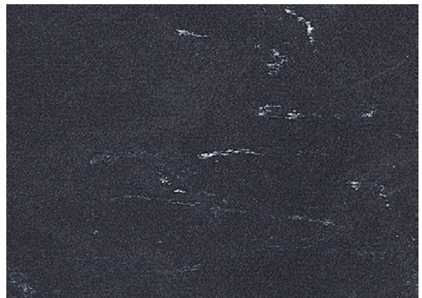
► Black Panther 8640* NCS S 8502-R