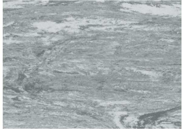
Graphite 9120* NCS S 4502-G