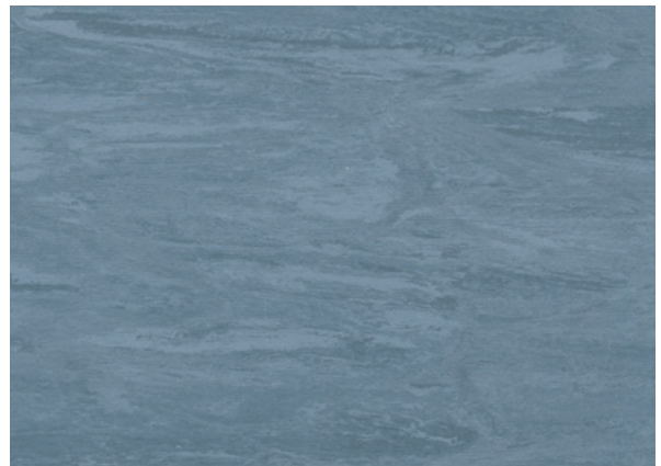
Atlantic Blue 9170 NCS S 4020-R90B