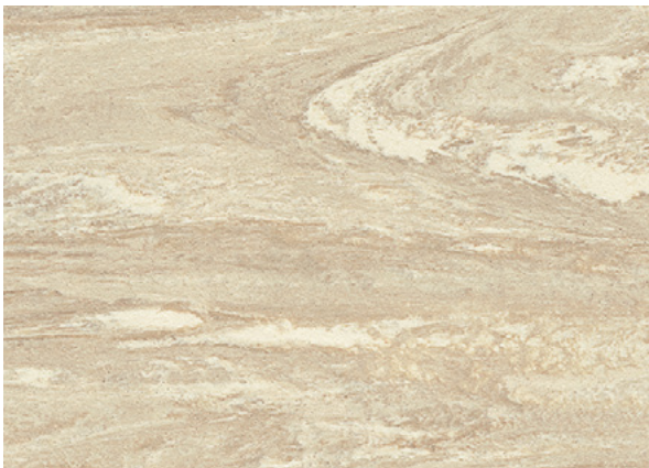
Mushroom 9110** NCS S 3010-Y30R