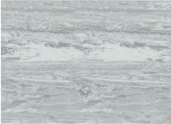
Slate Grey 9200** NCS S 4000-N