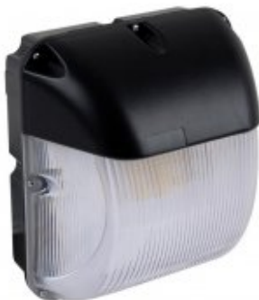
Avalon Wallpack Clear