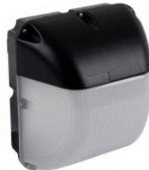
Avalon Wallpack Opal