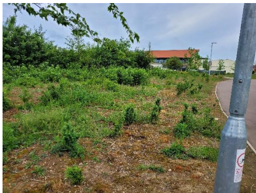
Section B – from the path junction looking towards the school