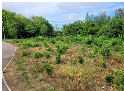
Section B – with back to the school, looking towards the path junction