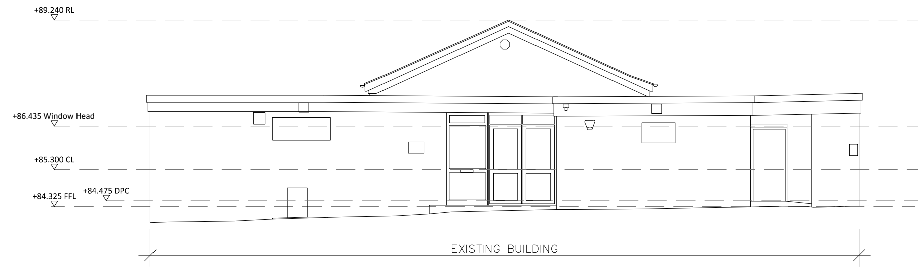
ELEVATION C - NORTH-WEST - FRONT