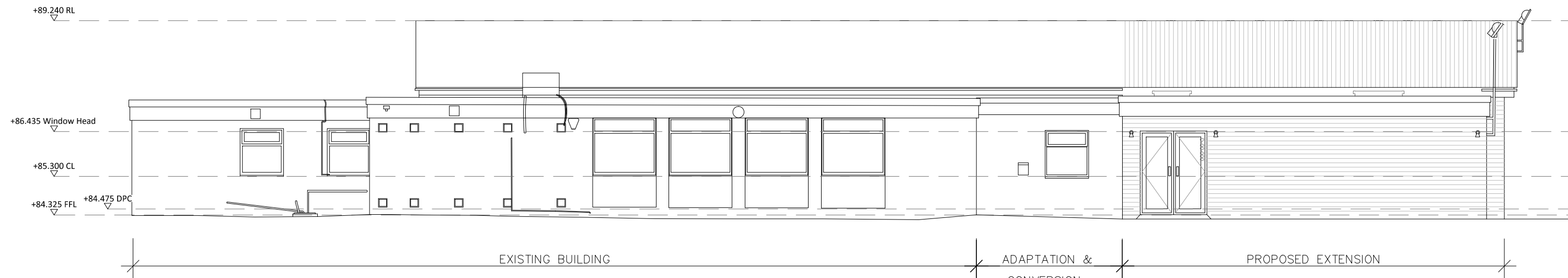
ELEVATION D - SOUTH-WEST - ROAD SIDE