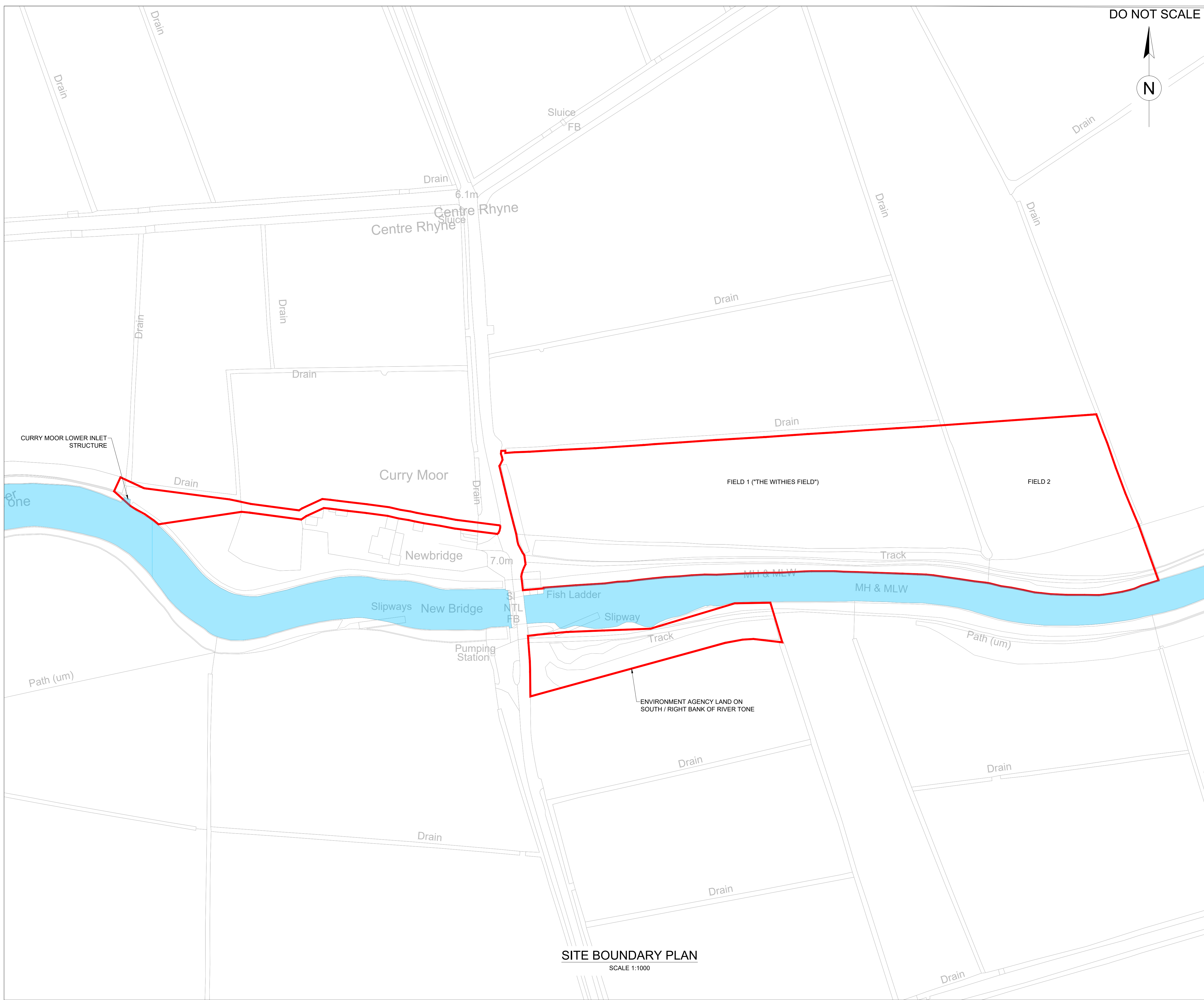
SITE BOUNDARY PLAN SCALE 1:1000