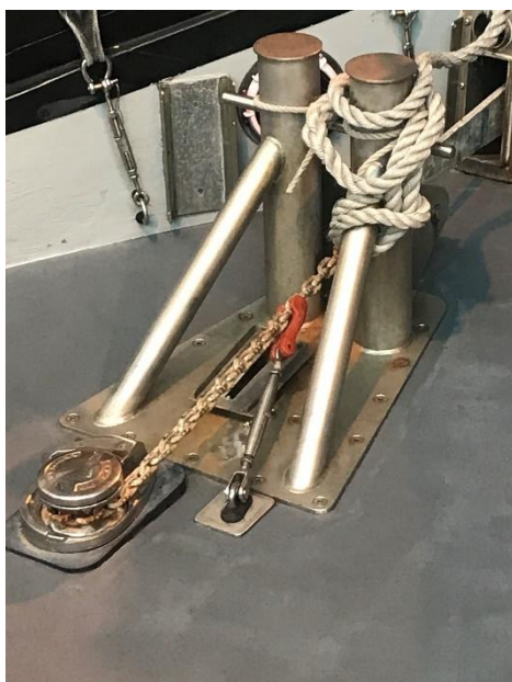
Final result - once modification made.