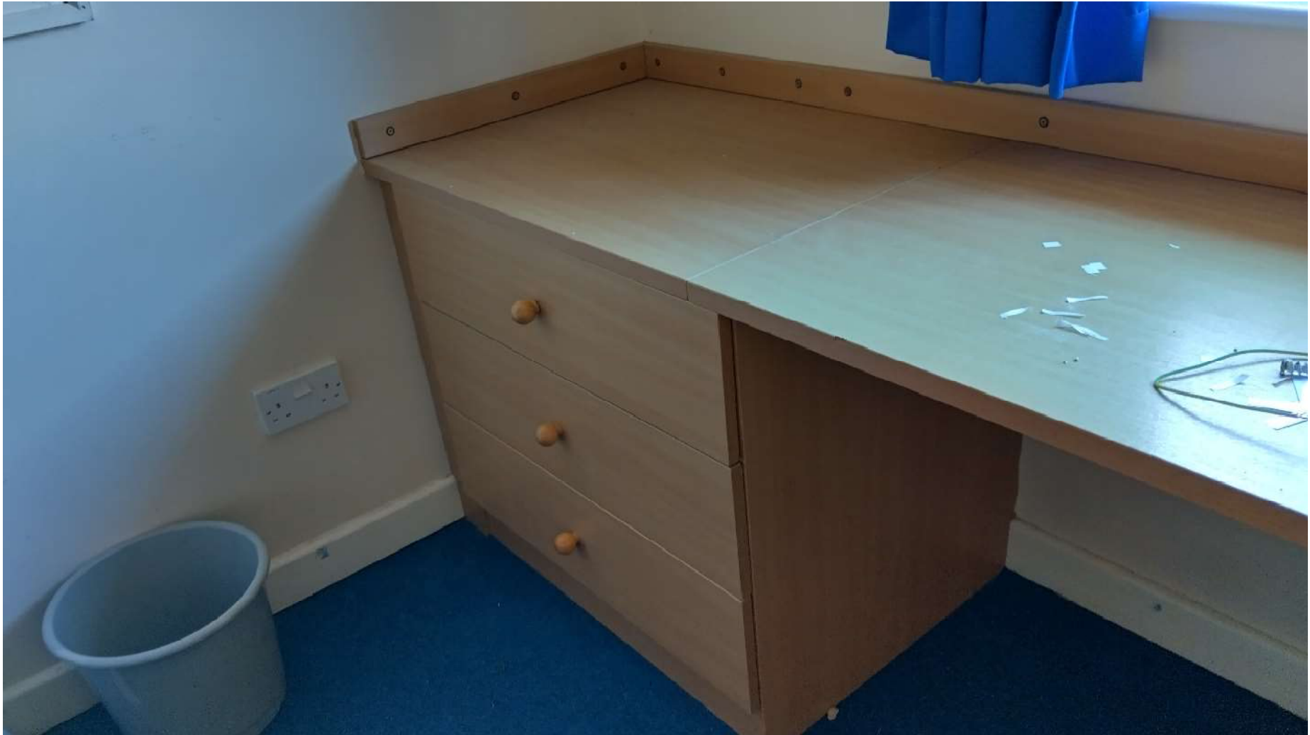
Photo 18: Petworth Hall bedroom fitted furniture (on top of carpet)