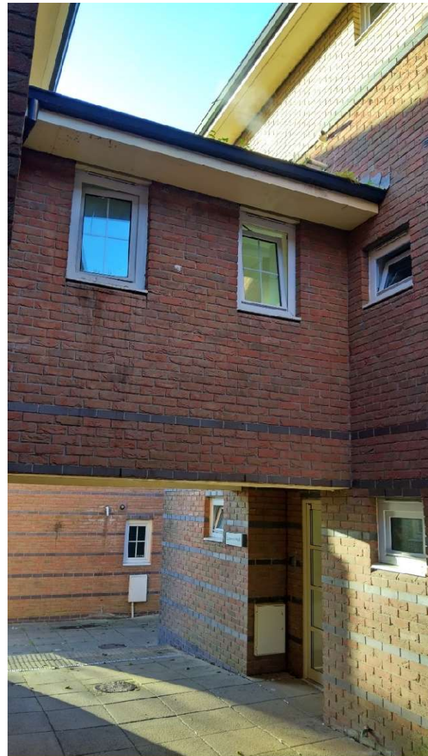
Photos 3 and 4 – Loxwood central lightwell (looking North and South respectively)