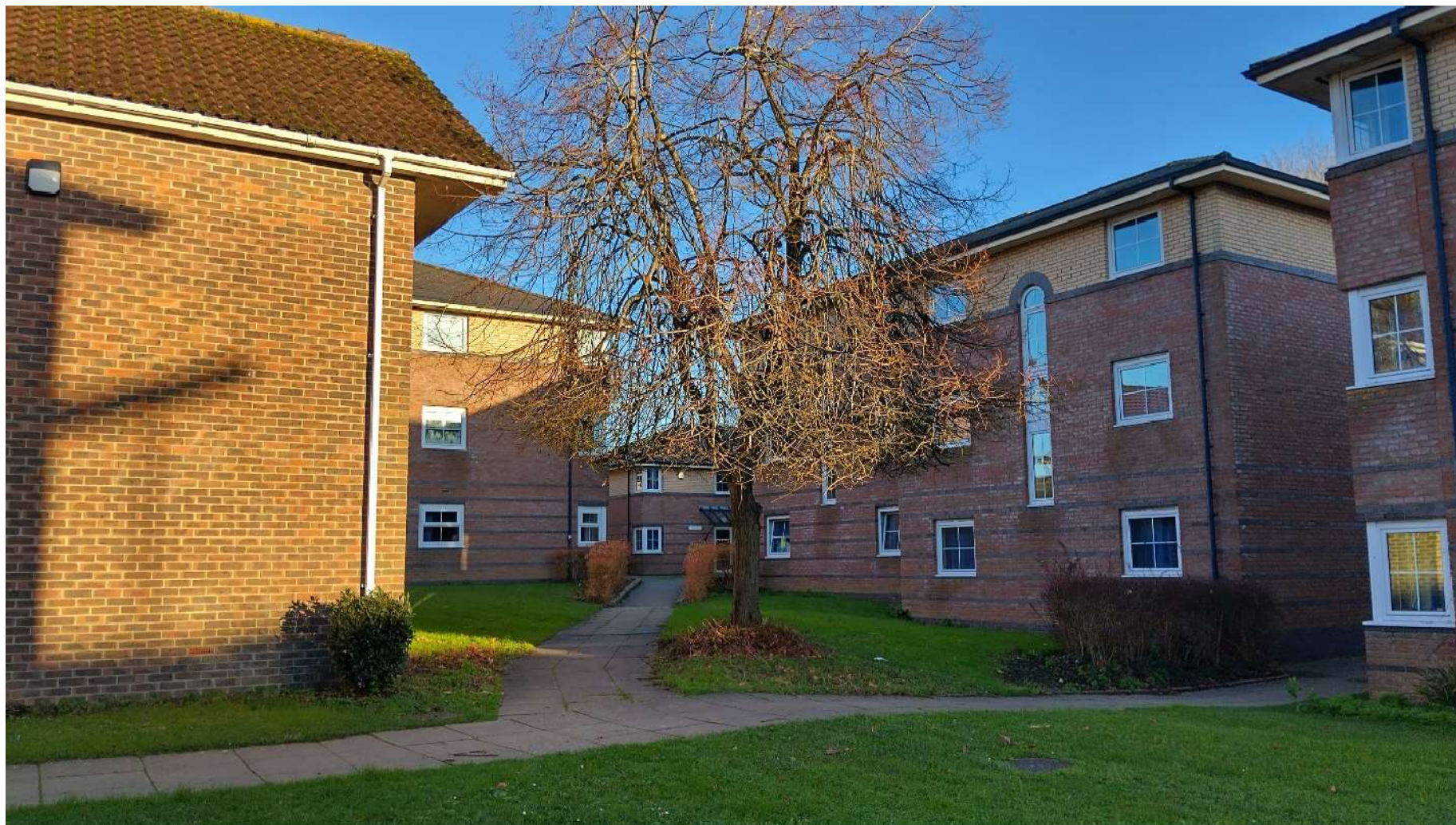
Photo 1 – Looking Northeast (South of Hammond 2): clockwise - Petworth, Duncton, Loxwood and corner of Midhurst