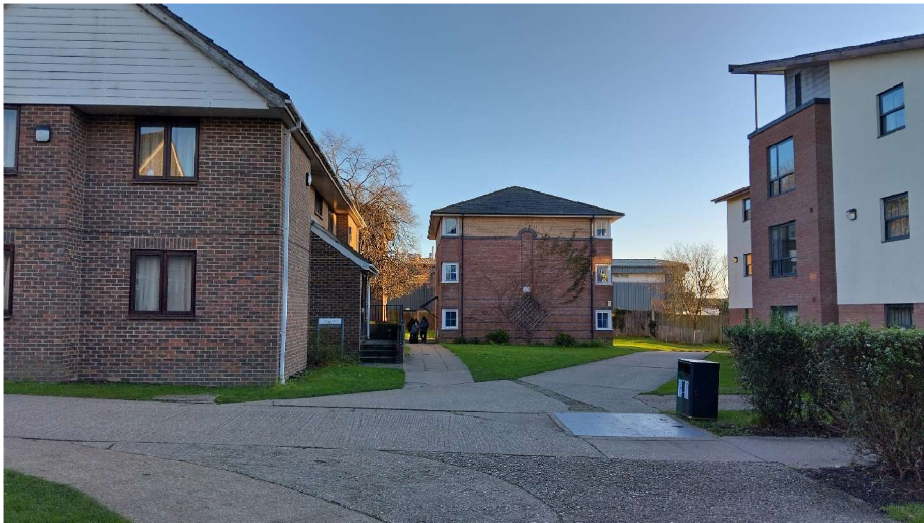
Looking East: Midhurst (centre), Hammond 2 and Chilgrove