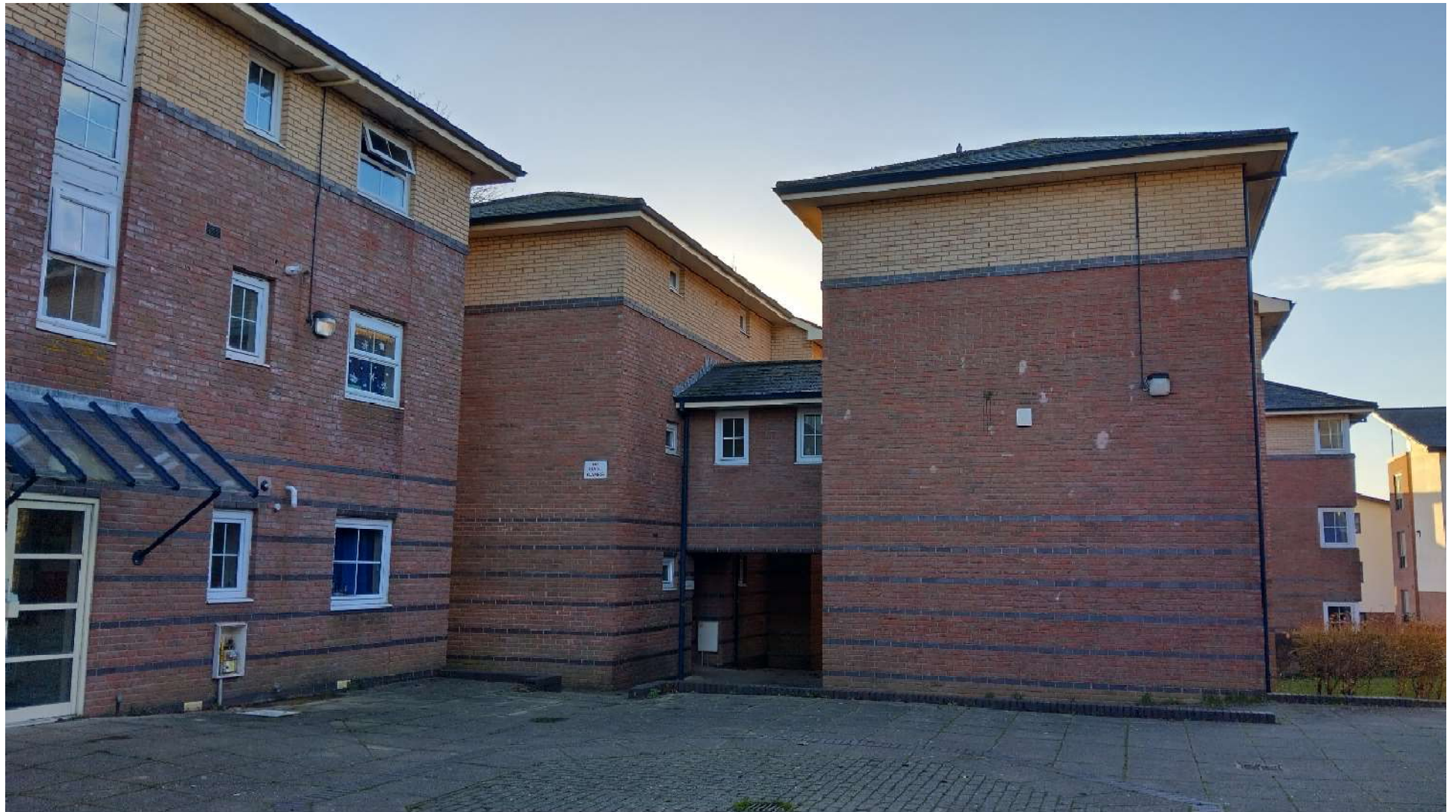
Photo 7 – Looking Southeast: Ifold and Loxwood (corner of Midhurst behind)