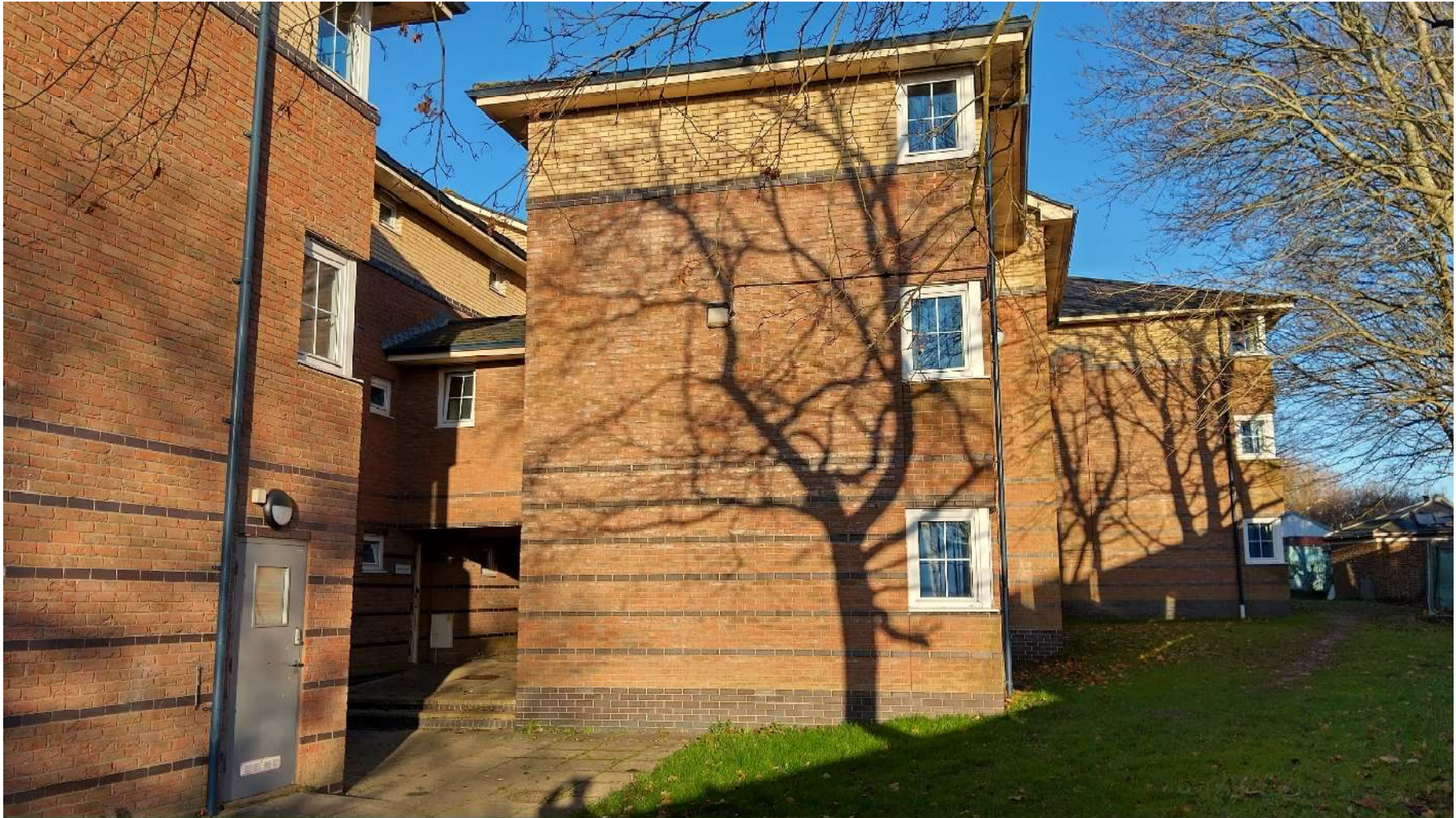
Photo 5 – Looking North: Loxwood and Ifold (Northeast corner of Midhurst also visible)