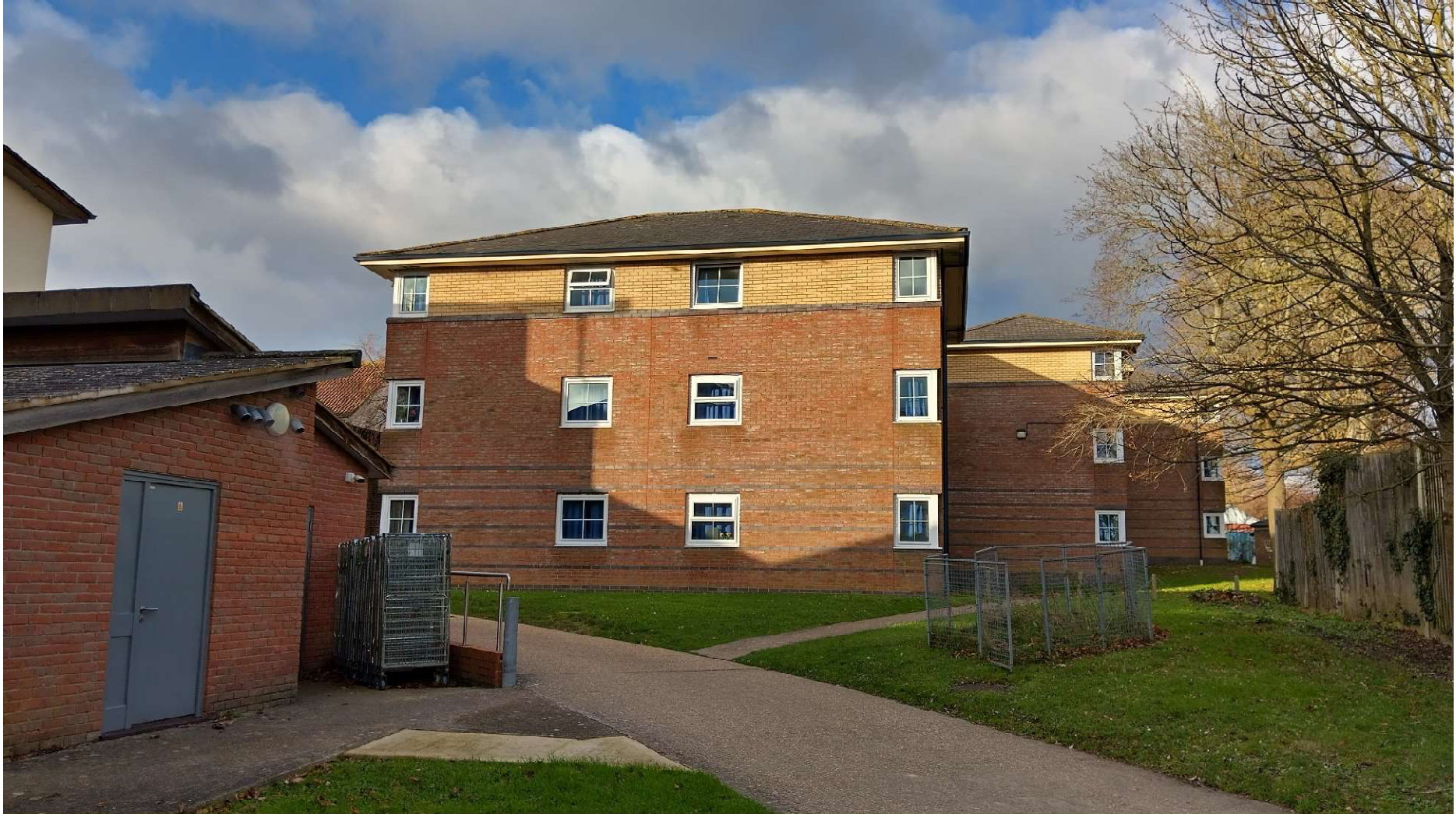
Photo 13: Looking North – Midhurst (Loxwood and Ifold stepped back to the right)