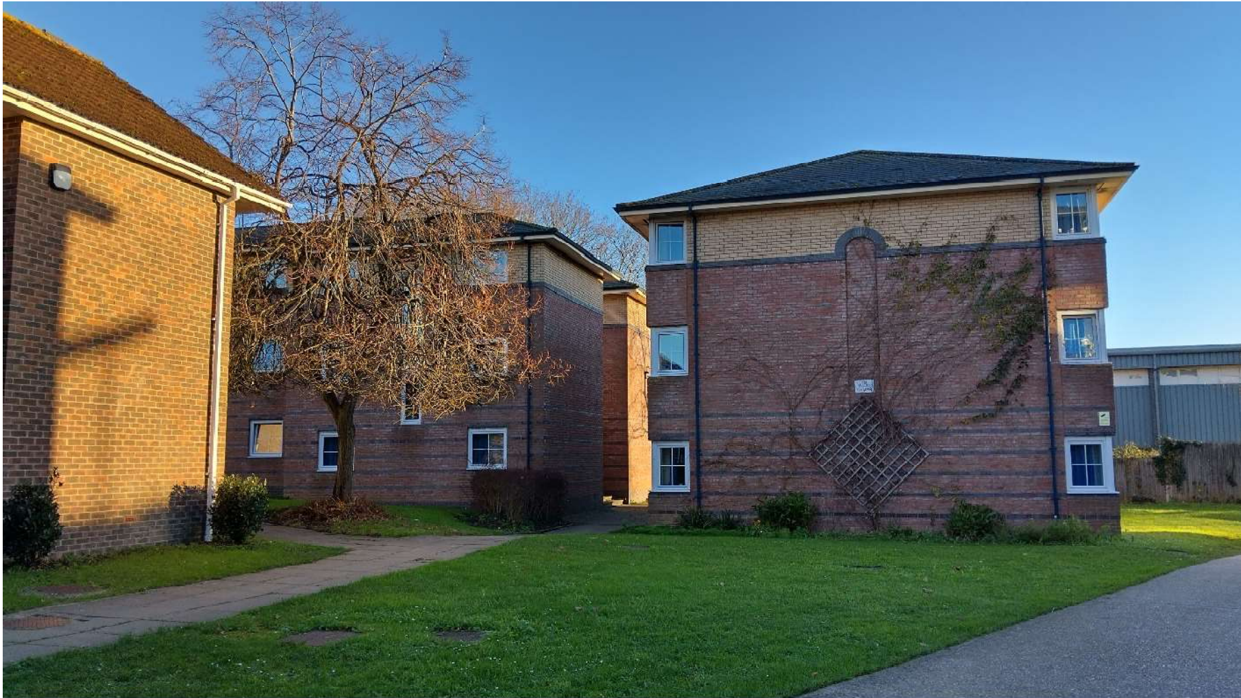
Photo 11 – Looking East: Midhurst (South ends of Loxwood and Hammond 2 also visible)