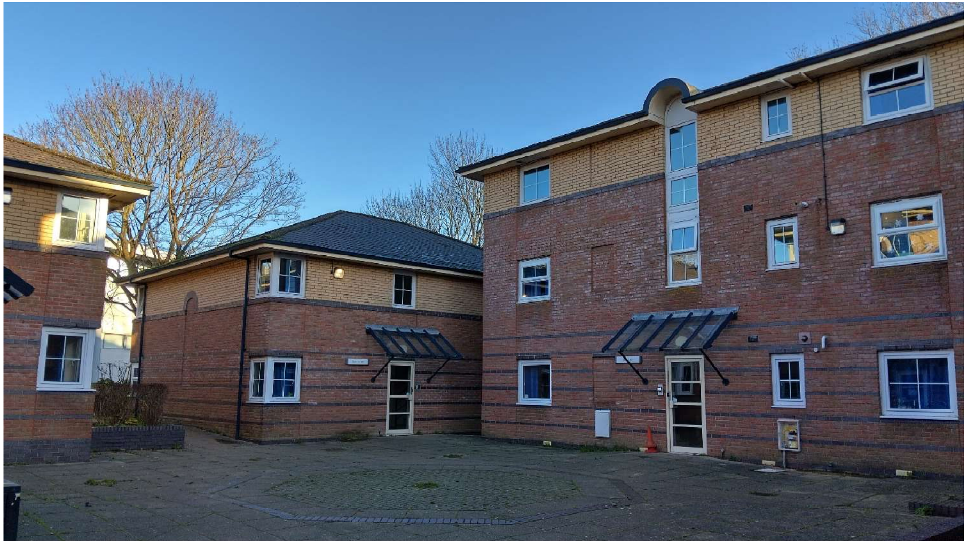
Photo 10 – Looking Northeast: Duncton and Ifold (with corner of Arundel)