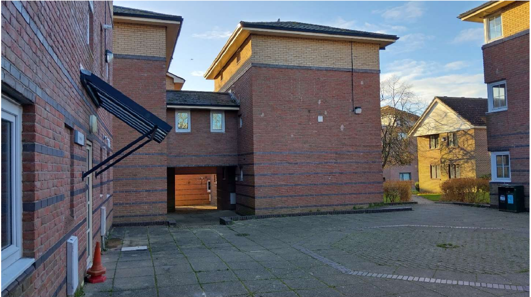
Photo 8 – Looking Southwest: Ifold, Loxwood and corner of Petworth (gable of Hammond 2 beyond)