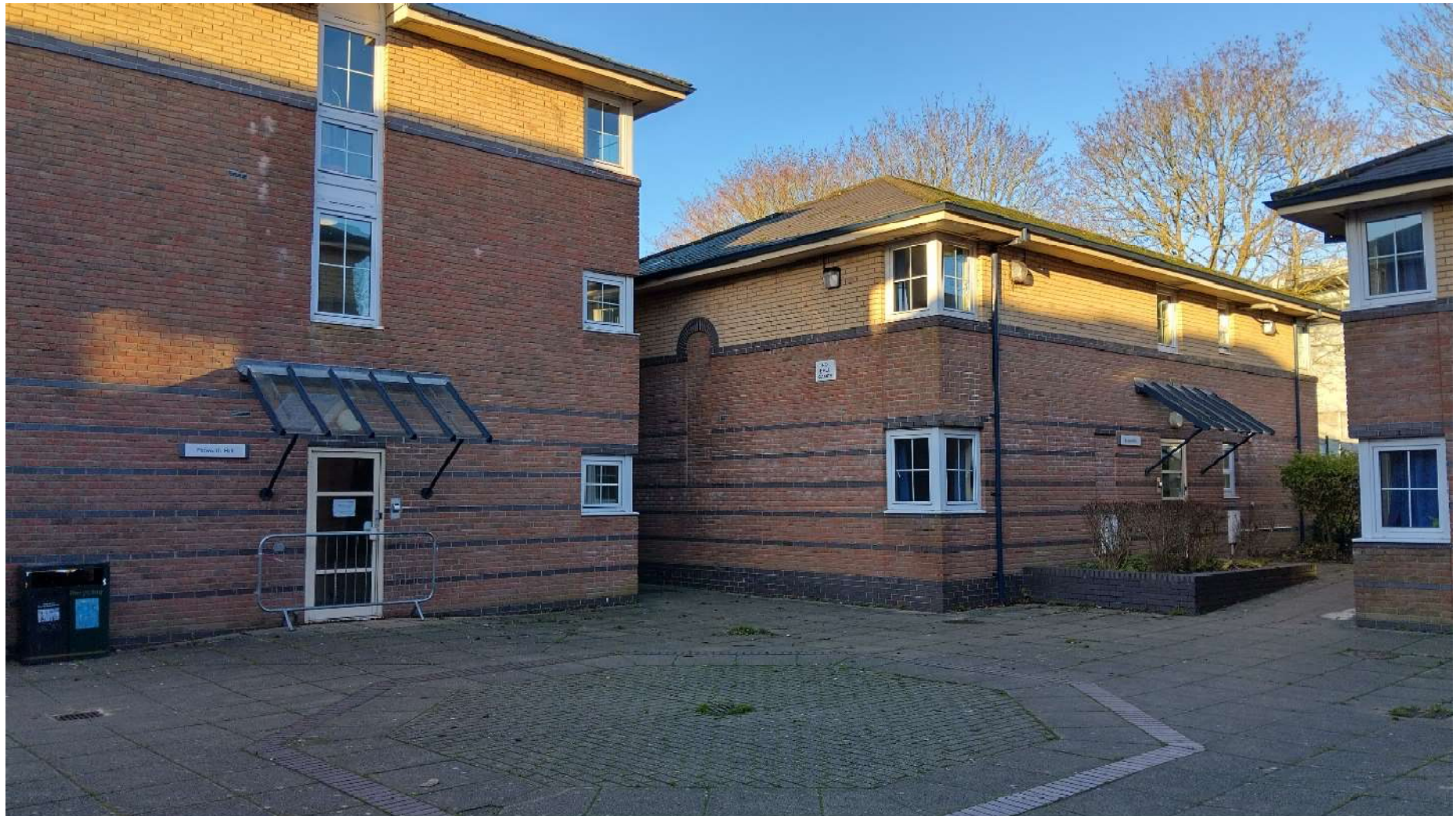
Photo 9 – Looking Northwest: Petworth, Arundel and corner of Duncton