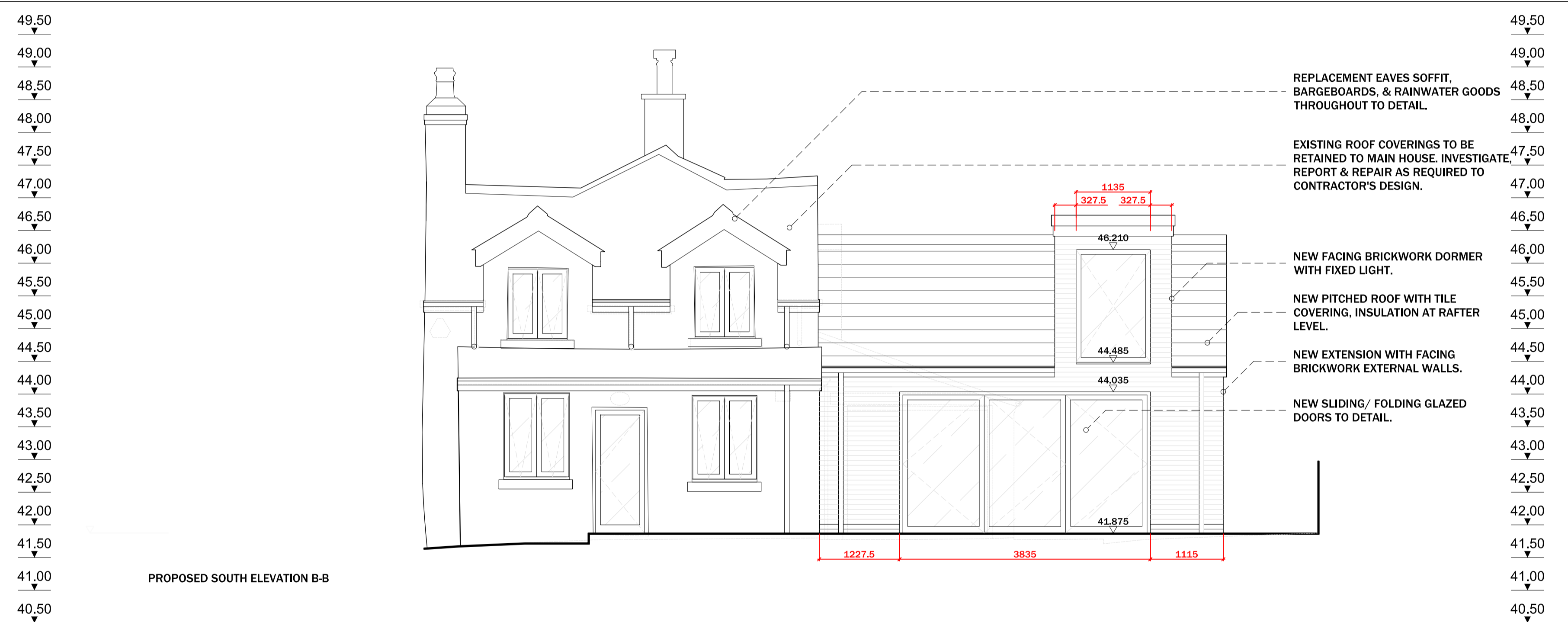
PROPOSED SOUTH ELEVATION B-B