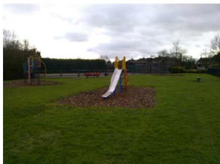
Slide with bark safety surface

Both the Playground and Tennis Courts are well used by the local community, however, there has been no significant investment in the facilities on this site for 20 years.