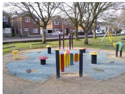
Oakfield Park Blaby

In addition, Braunstone Town only has traditional play equipment at its parks, and there is a variety of sensory play equipment available. Such equipment was recently installed at Oakfield Park, Blaby and was well received by parents since it allows for play for all ages and abilities and in particular those physically unable to use traditional play equipment such as swings and slides, installing such equipment at an existing playground allows for the family and friends to enjoy play and recreation together.