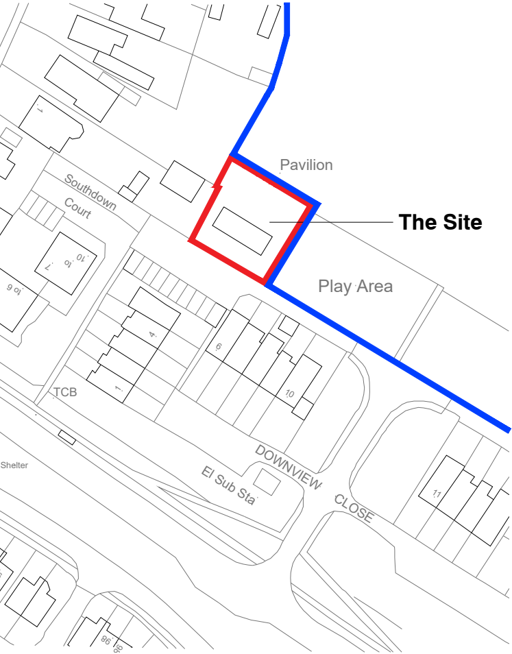
Location Plan Scale 1:1250@A3