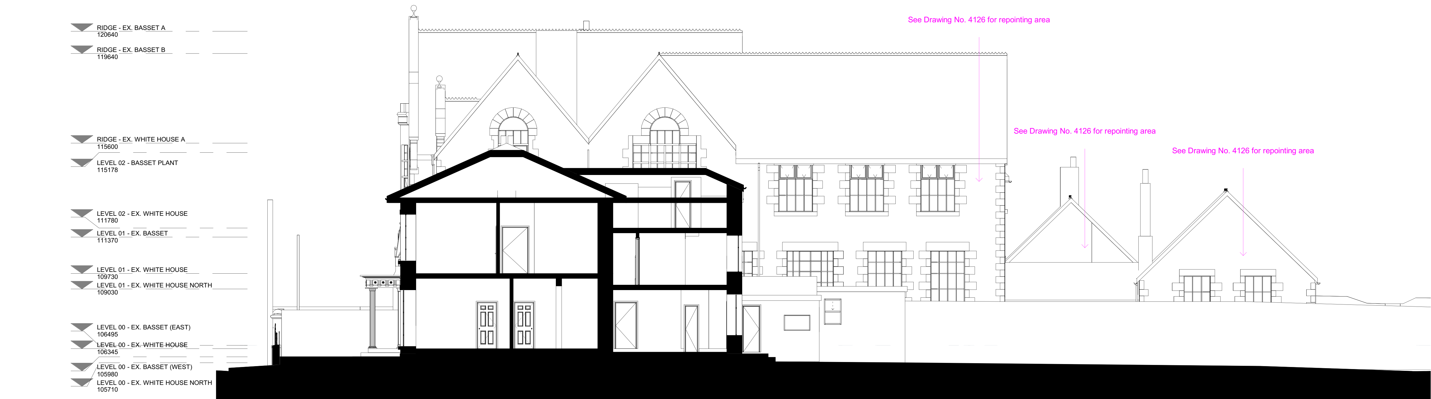
SECTIONAL ELEVATION - GA - EXISTING - HH - NORTH - GRANITE FACADE REPAIR & REPOINTING