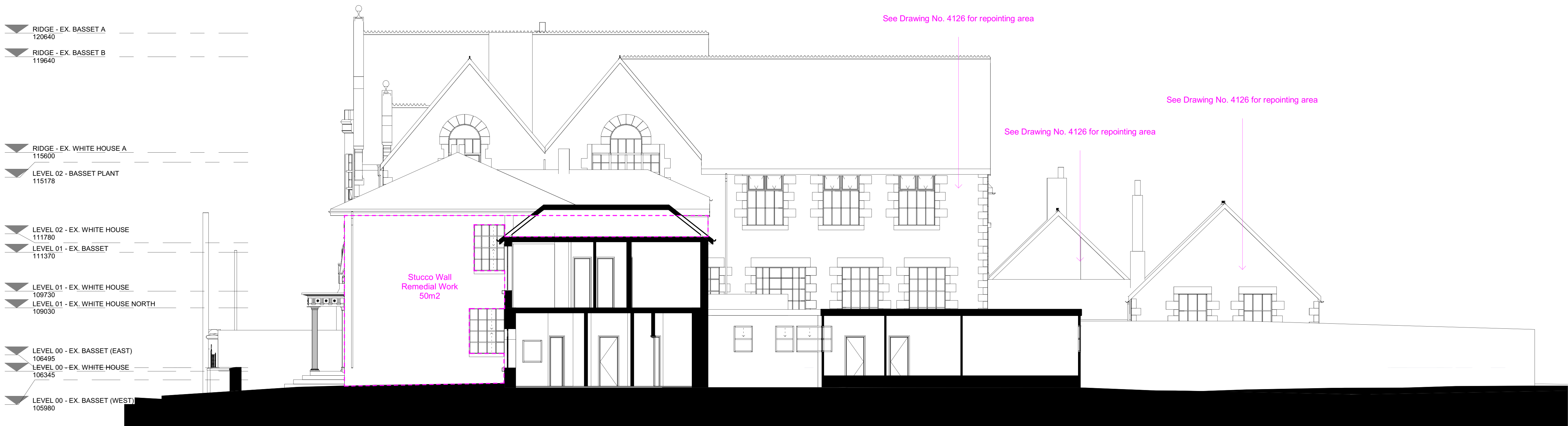
SECTIONAL ELEVATION - GA - EXISTING - GG - NORTH - GRANITE FACADE REPAIR & REPOINTING