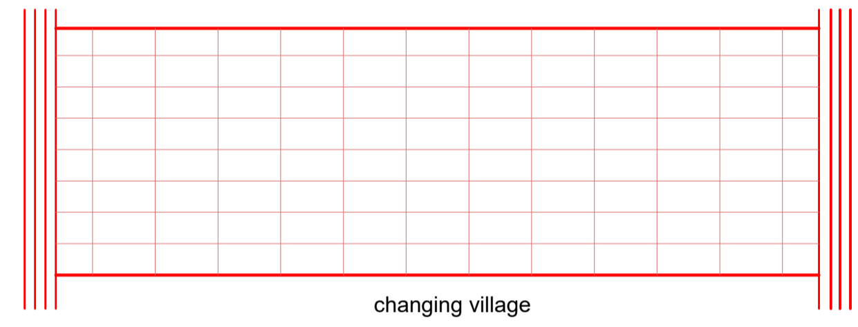
internal wall elevation B as proposed 1:50