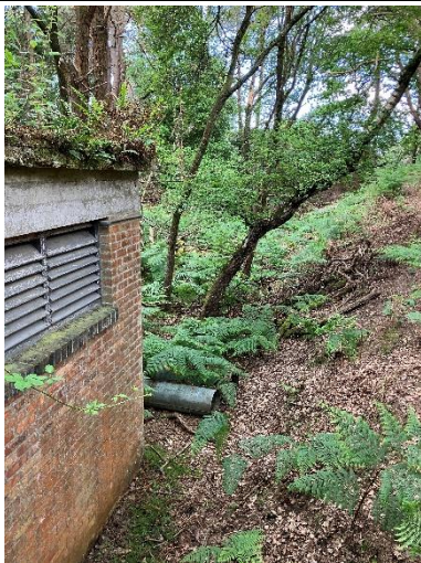
Door; Louvre (east). Circular openings (south).