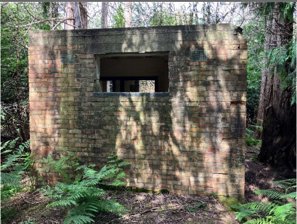
Door; Windows (west).