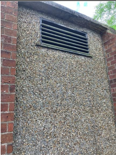
Door; Louvre; Holes (north). Holes (north). Louvre (south). Window openings (west)(south).