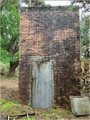
Door (west).