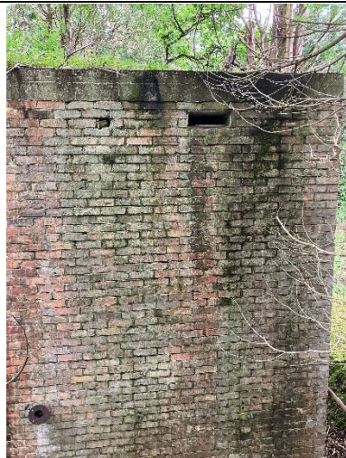
Door opening (west). Barn owl entrance.