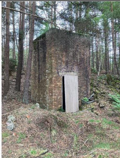
Door opening (west).