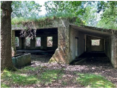
Windows (south). Openings (south)