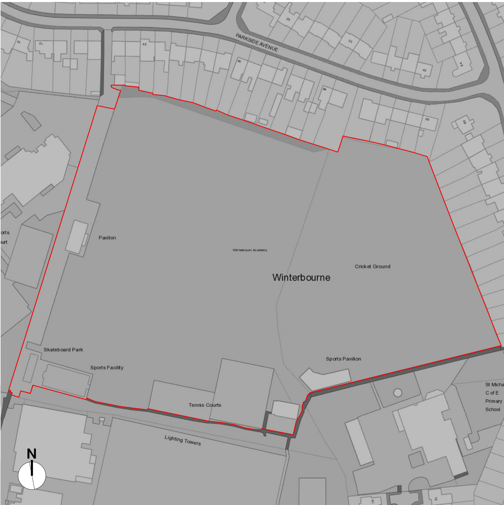
Existing Site Location Plan @ 1:1250