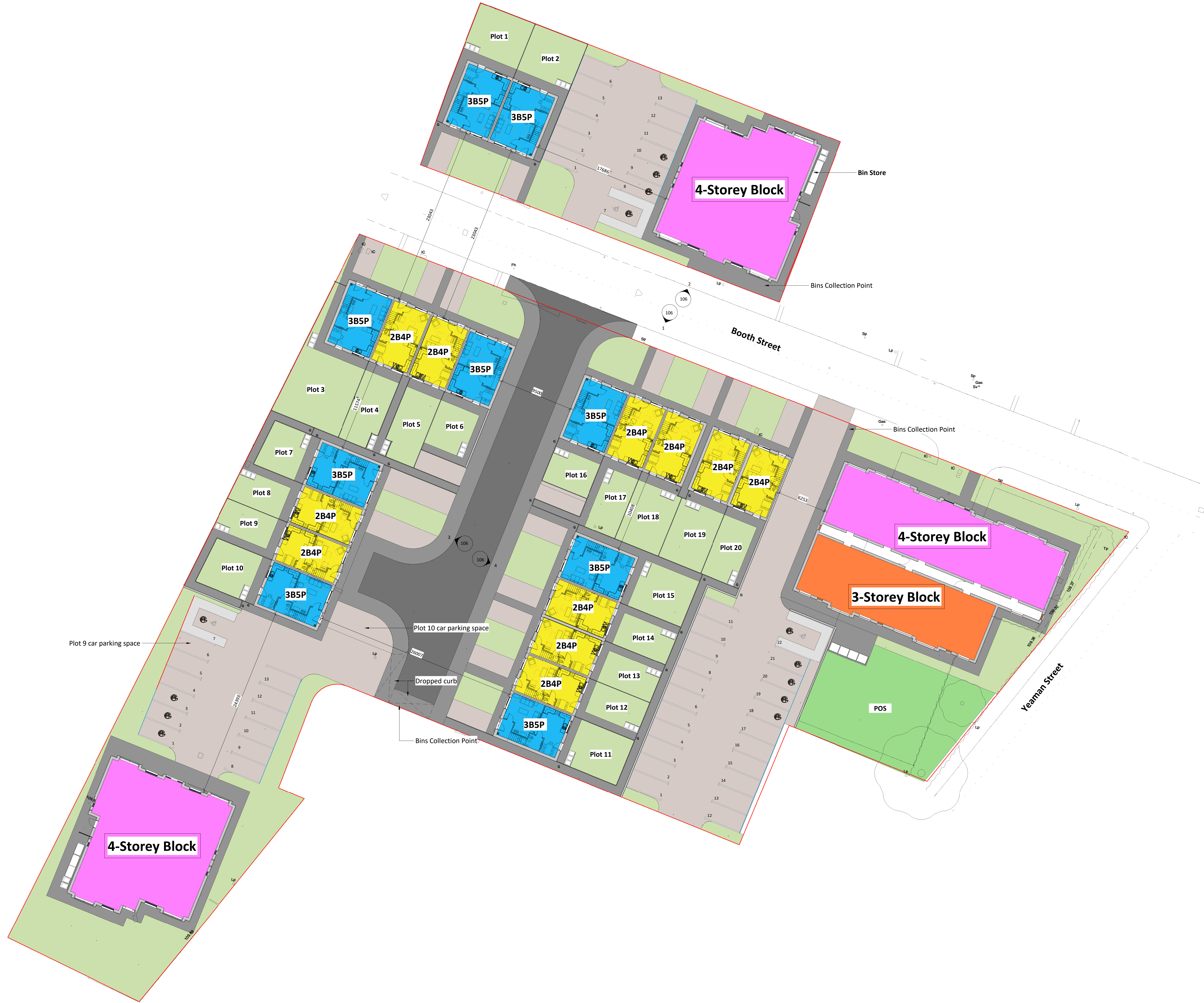
Proposed Site Plan 1 : 200