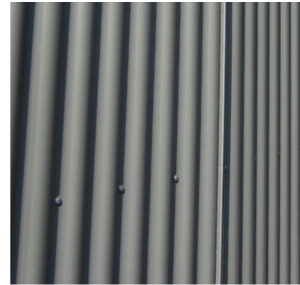
corrugated metal cladding

REVISION A: Issue for Planning Submission 15.03.24