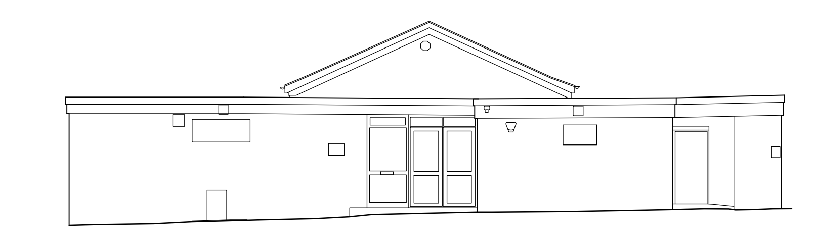
ELEVATION C - NORTH-WEST - FRONT