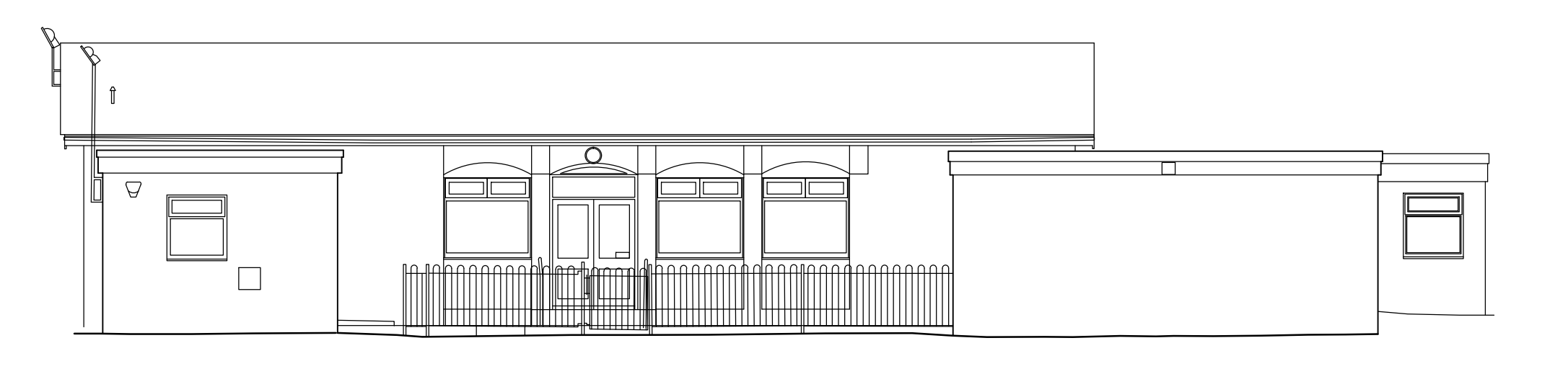
ELEVATION B - NORTH-EAST - PITCH SIDE