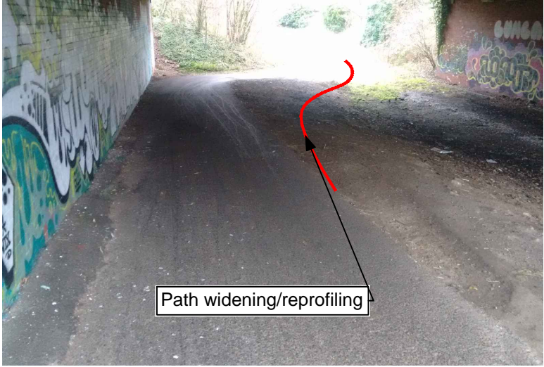
Image 3 Below east side of Kingsway: realign path and improve camber (view facing east)

All resurfacing work in accordance with Sustrans Standard Detail SD/01