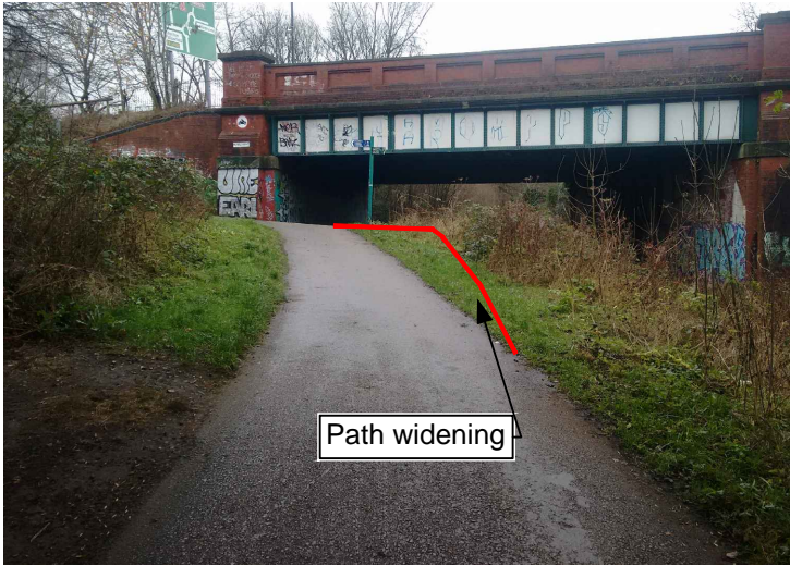
Image 2 Build out and widen path where access point west of Kingsway meets main path (view facing east)