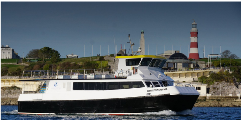
Image 8- Example of an electric ferry