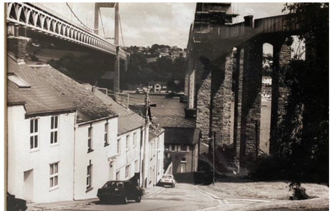
Image 4 - Old photo of Lower Fore Street, Saltash