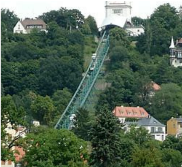
Image 3- Suspended railway in Dresden, Germany