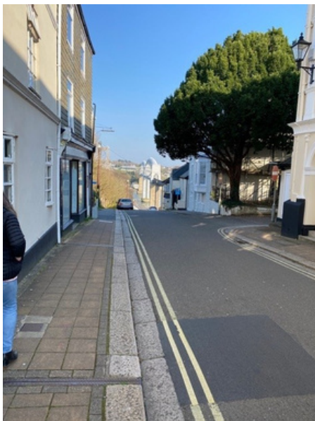
Image 11 - Top of Lower Fore Street Saltash