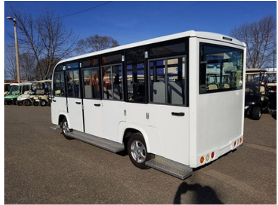
Image 2- Example of an electric bus