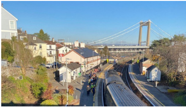
Image 7 - Saltash Railway Station