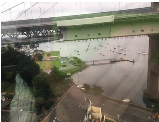
Image 9 - Saltash Pontoon managed by the council