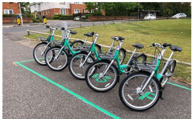
Image 5- Electric Bike by Beryl