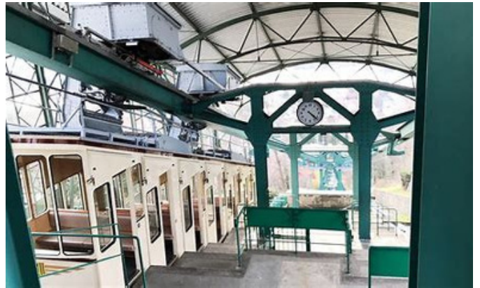
Image 4- Suspended railway in Dresden, Germany