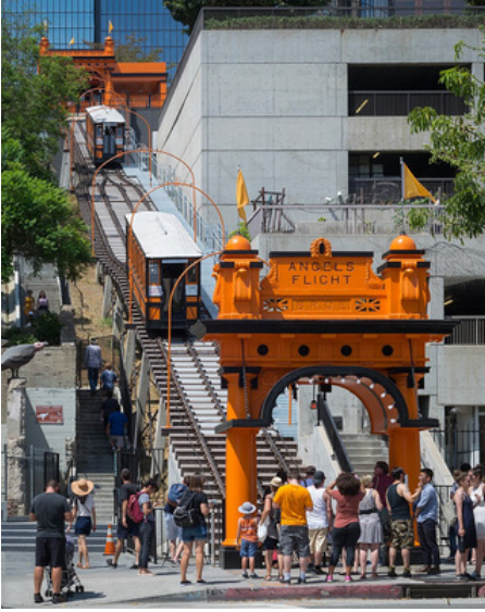
Image 1- A three way funicular in Los Angeles, California