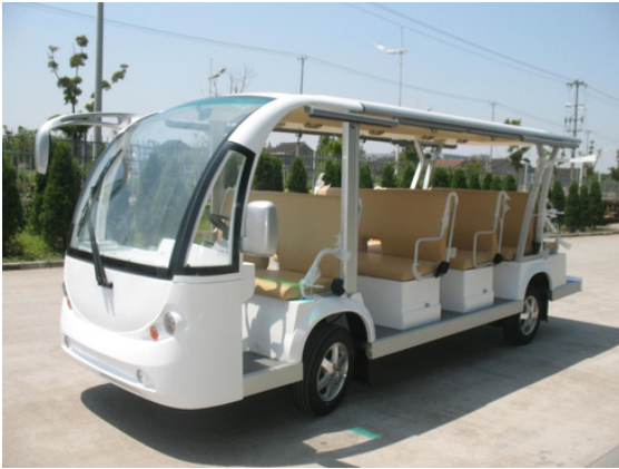
Image 1- Example of an electric mini bus