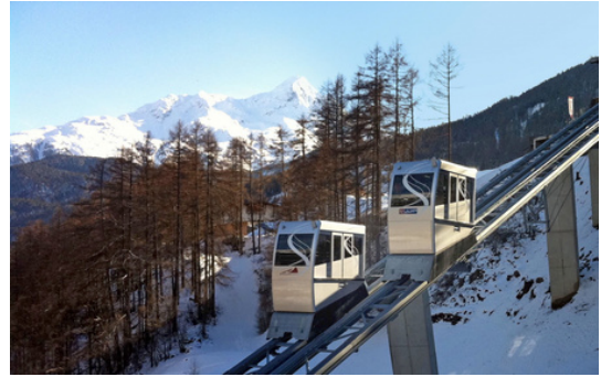
Image 2- Inclined Lift, Austria