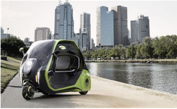
Image 6- Example of an electric Tuk Tuk