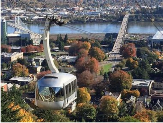
Image 1- Aerial tram in Portland, USA