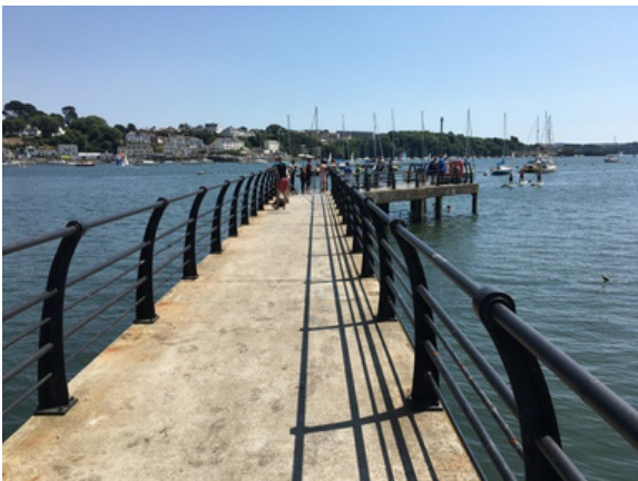
Image 3 - Saltash Pier