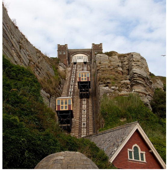
Image 2- Cliff railway, Hastings