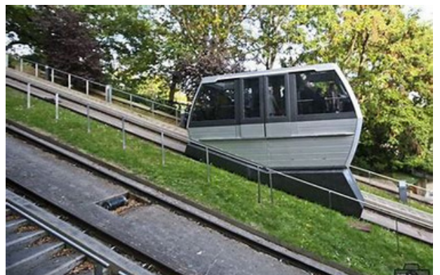
Image 6- Monmartre funicular, Paris