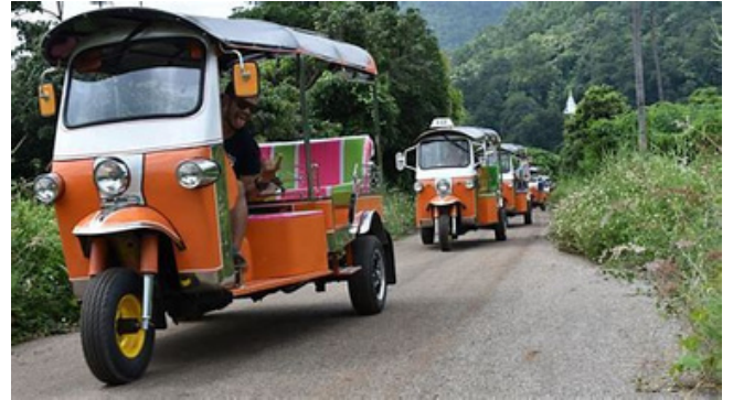
Image 7- Example of an electric Tuk Tuk going up hill