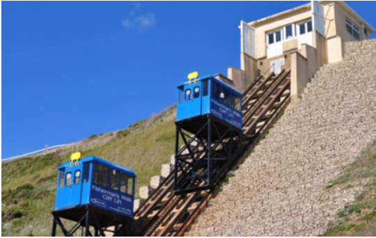
Image 1- Fishermans Walk Cliff Inclined Lift, Bournemouth