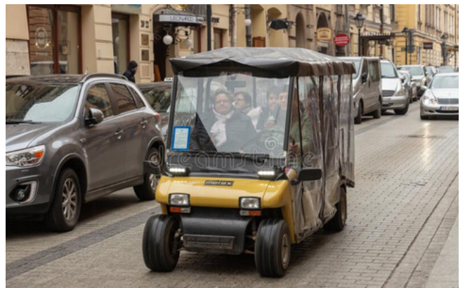
Image 3- Electric Buggy in Poland