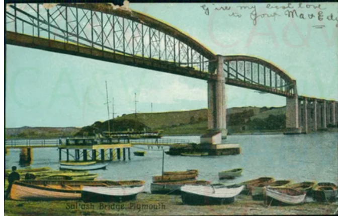
Image 2 - Saltash Bridge