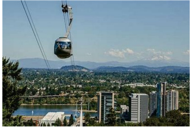
Image 2- Aerial tram in Portland, USA