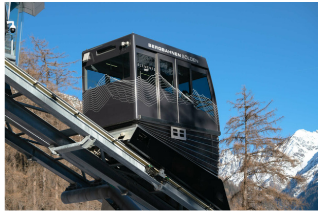
Image 4- Inclined Lift in Sölden, Austria