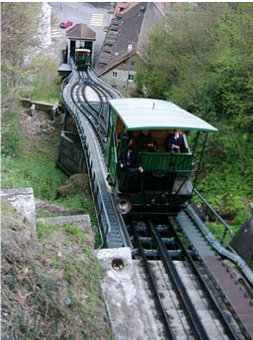
Image 3- A Funicular using waste water in Fribourg, Switzerland