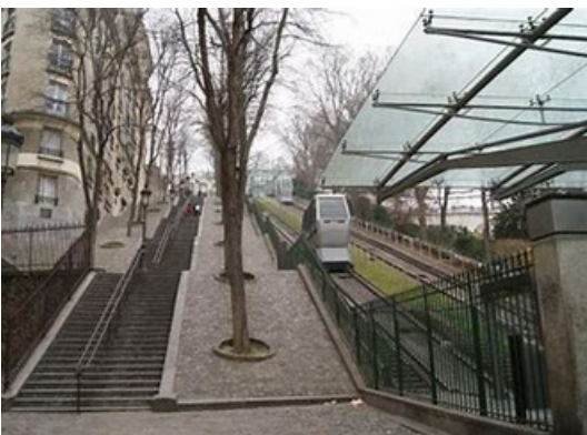
Image 5- Monmartre funicular, Paris