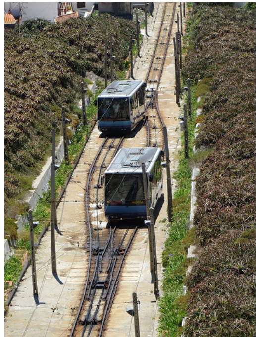
Image 4- A two railway funicular in Nazare, Portugal