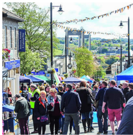
Image 10 - Fore Street, Saltash