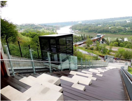
Image 3- Inclined Lift, Austria