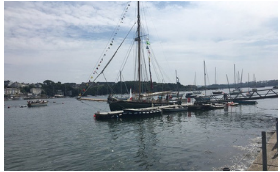
Image 8 - Saltash Sailing Club pontoon