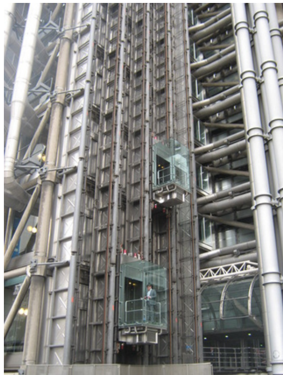
Image 6- Lift outside the Lloyds Building, London