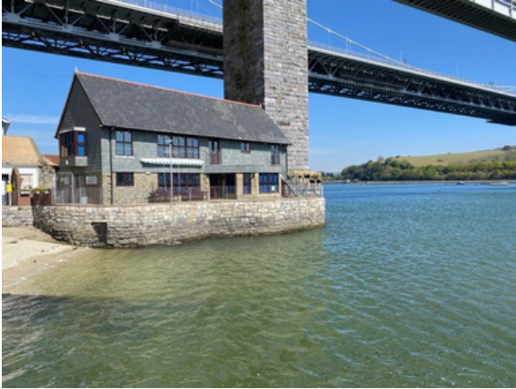
Image 1 - Ashtorre Rock Community Centre