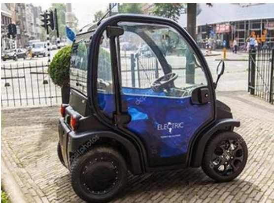
Image 3- Electric Car