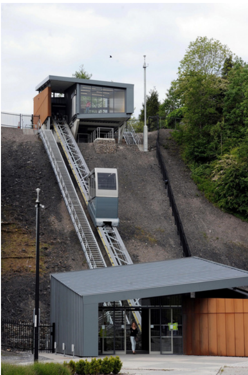
Image 5- Inclined Lift, Wales