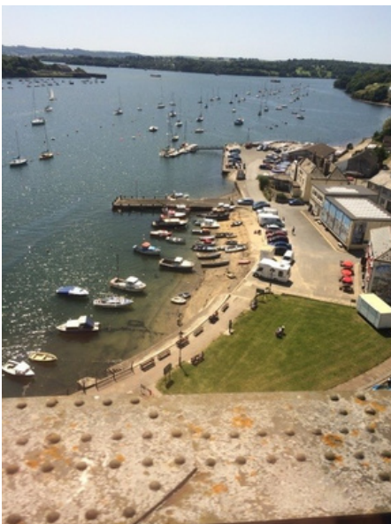
Image 5 - Waterside area at Saltash including flood prevention,