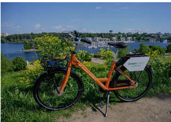
Image 4- Electric Bike by Donkey Republic