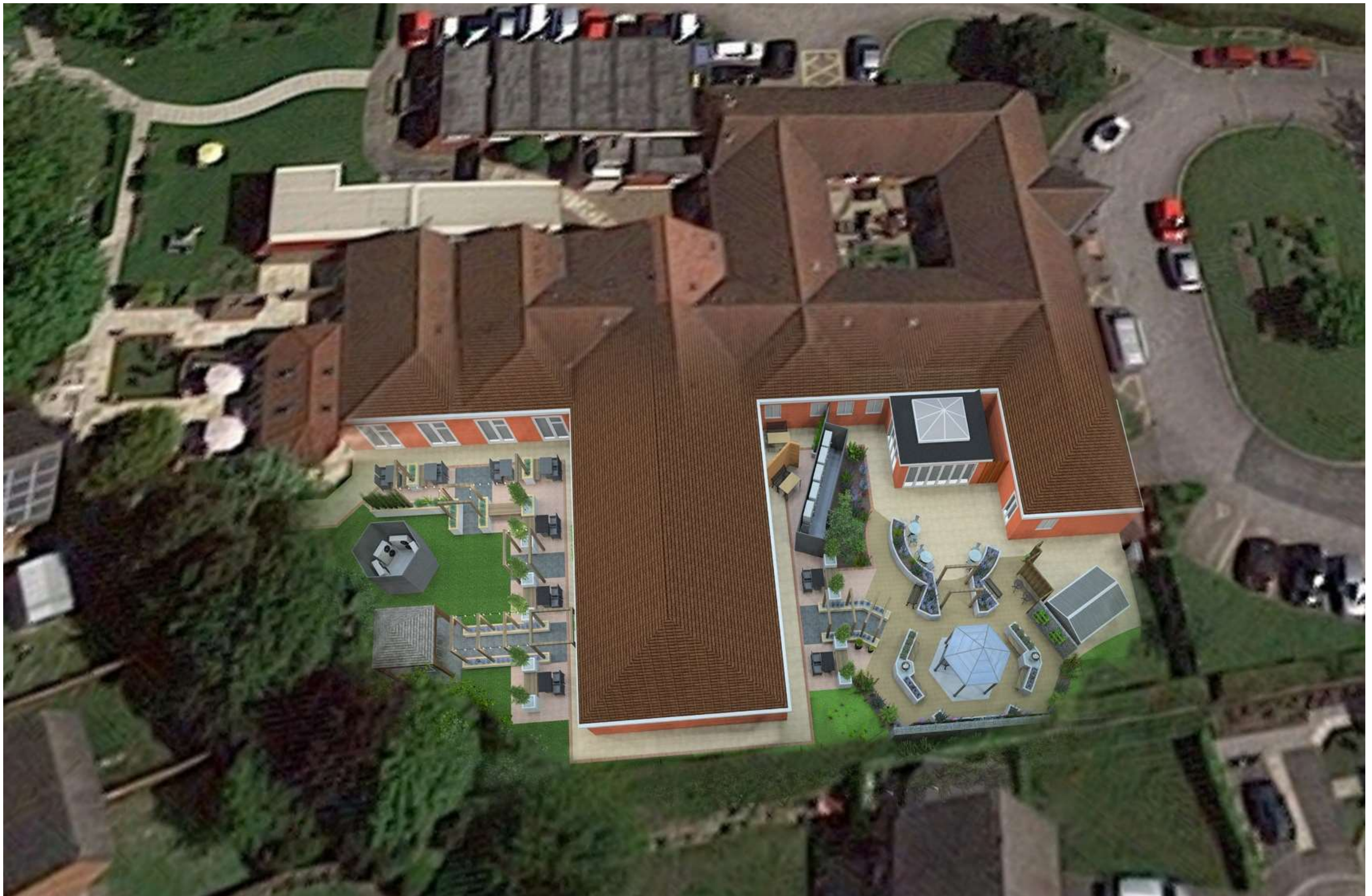
Proposed scheme overview