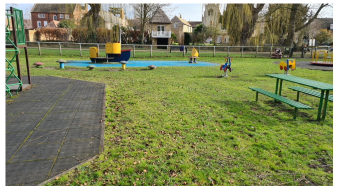
Various views of the existing site