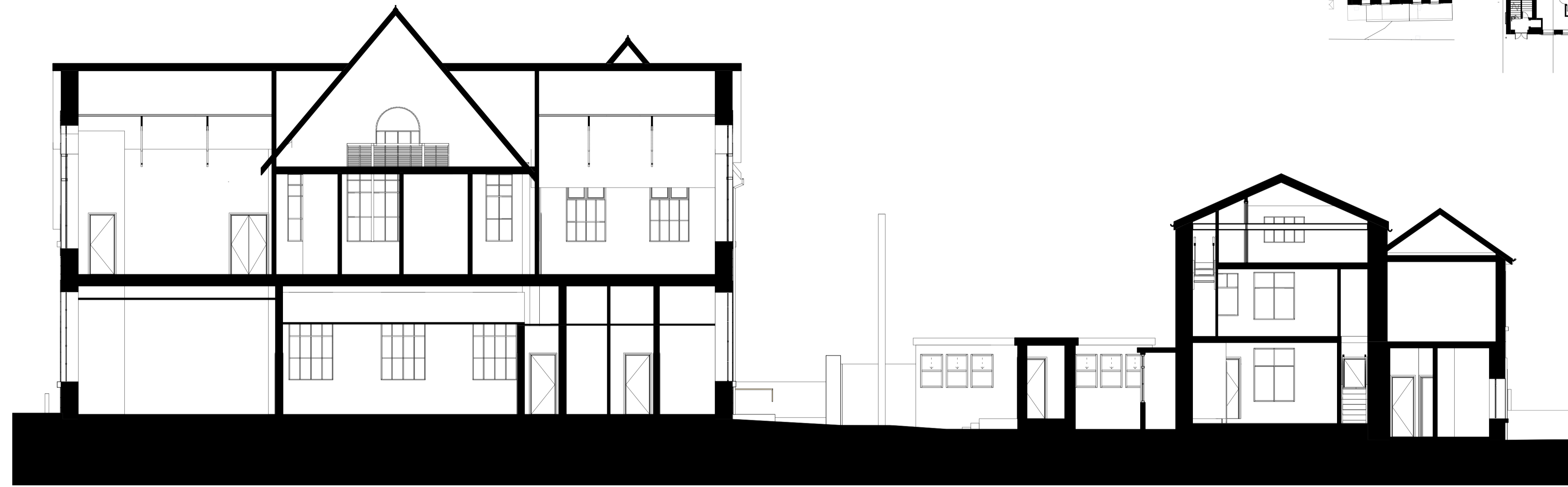
SECTIONAL ELEVATION - GA - ENABLEW - AA - EAST - GRANITE FACADE REPAIR & REPOINTING