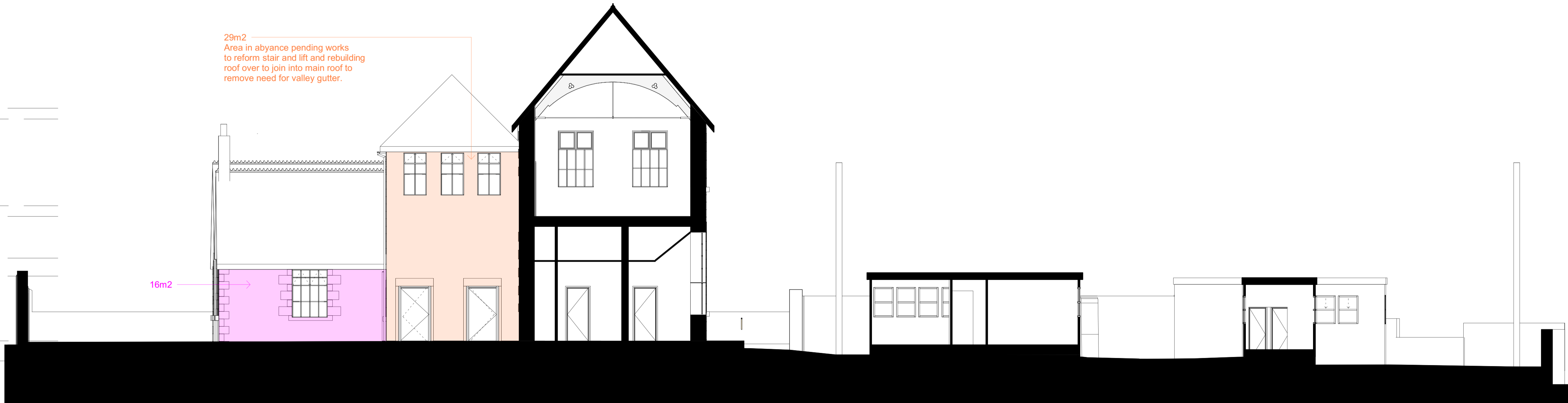
SECTIONAL ELEVATION - GA - ENABLEW - BB - EAST - GRANITE FACADE REPAIR & REPOINTING