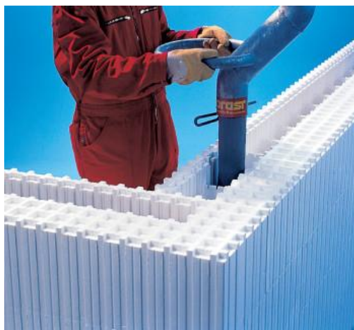
10. Concreting with the Wallform nozzle and ready-mix concrete or dry concrete from a silo.