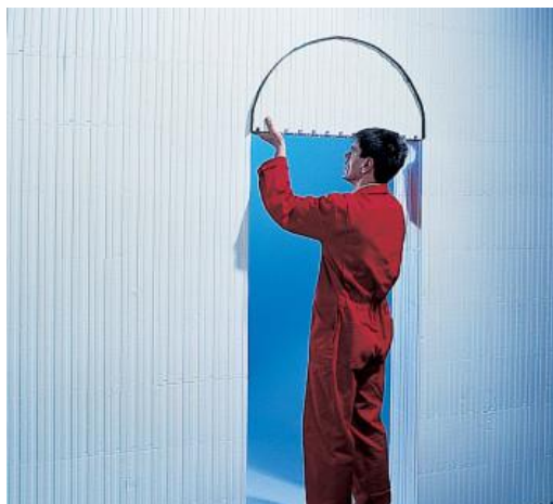
7. Arches are formed by cutting the opening shapes and inserting a metal sheet to act as a curved shutter.