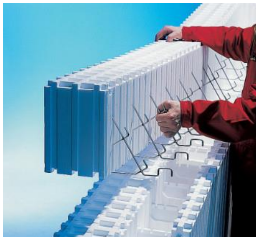
8. The Wallform floor edge blocks accommodate practically all types of solid floor and prevents thermal bridging.