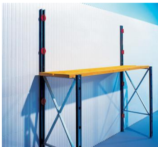
9. With the Wallform prop and screw support system, the wall is held in the vertical position.