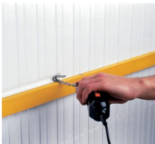
11. Forming service chases in minutes is possible with the Wallform hot wire cutter.