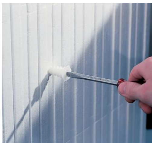
12. Using BTI Wallplugs, lightweight fixings plug into the insulation foam, heavyweight fixings plug into the concrete core.