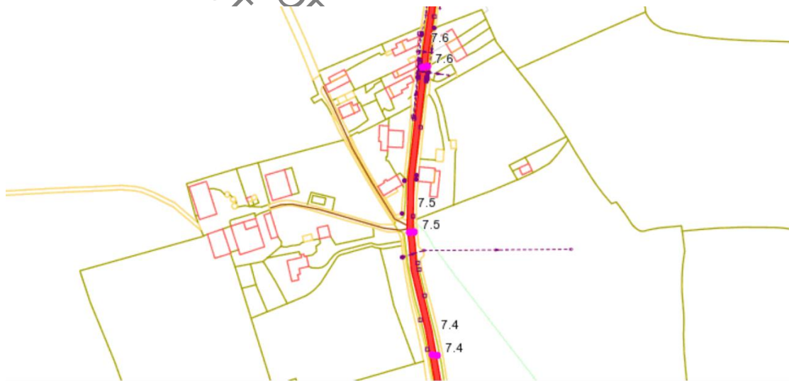
Fig 1.1 -HE drainage assets

1.3.4 Data submission to be as per CS 551; Section 7.54 inclusive of all requirements within subsections 1 to 5.